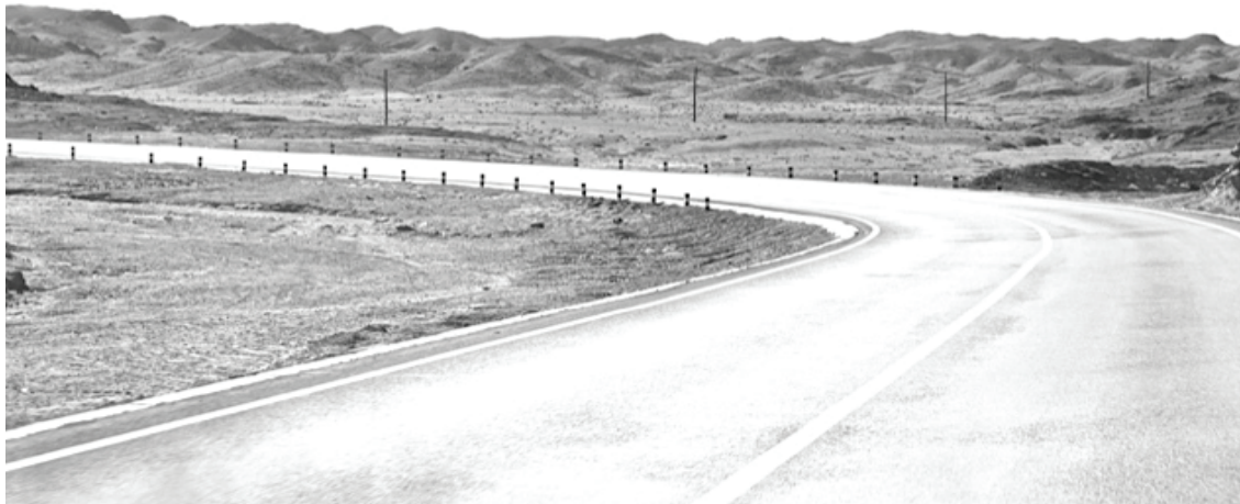
Area 42 Pre-conference Assembly March 27- 29, 2015